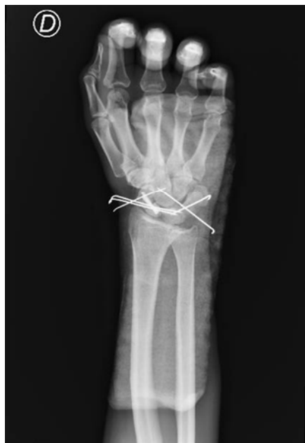
Figure 3. Anterior-posterior X-ray of the right hand and wrist taken immediately after surgery.

Immediately after surgery, follow-up X-rays (Figures 3 and 4) showed adequate reduction of the fracture dislocation with shaft recovery, no loss of joint congruence, and osteosynthesis material in the proper position. The patient was discharged 48 hours after surgery with indications for analgesic management (oral), immobilization with a volar forearm splint, and a follow-up appointment in 2 weeks. Four weeks after surgery, the percutaneous fixation with Kirschner wires was removed (Figures 5A and B), and the volar forearm splint was replaced with a wrist brace.