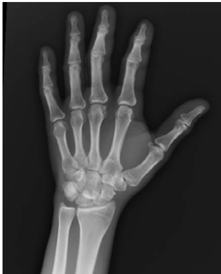
Figure 1. Anterior-posterior X-ray of the right hand after trauma. A right dorsal trans-scaphoid perilunate fracture dislocation is observed.

Five weeks after the trauma, the patient was assessed by specialists from the hand surgery unit. On physical examination, a positive Tinel's sign was identified (pins and needles sensation after pressing on the median nerve by repeatedly tapping the carpal tunnel with a finger); however, it was not possible to accurately perform the Phalen's maneuver due to pain. No signs or symptoms suggestive of compartment syndrome, such as severe and progressive pain, marked edema, absence of pulse, or pallor, were observed. Given these findings, carpal tunnel syndrome was diagnosed. Upon reviewing the X-rays taken on the day of the trauma (Figures 1 and 2) and the CT scan requested two weeks after sustaining it, a right dorsal trans-scaphoid perilunate fracture dislocation was identified. The affected area was therefore immobilized using forearm splinting and a surgery was scheduled.