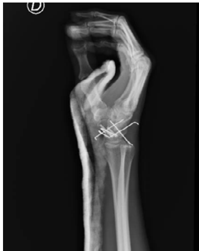
Figure 4. Lateral X-ray of the right hand and wrist taken immediately after surgery.