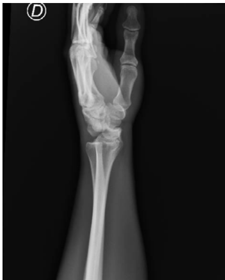
Figure 2. Lateral X-ray of the right wrist after the trauma. A dorsal trans-scaphoid perilunate fracture dislocation is observed.

Source: Image obtained while the patient was being treated.